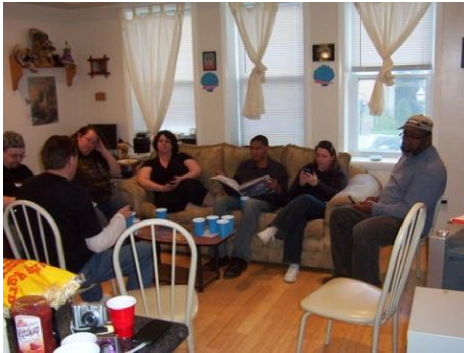
Everyone is always welcome to join!