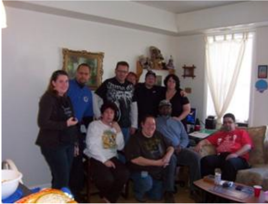
STAR TREK FANS!