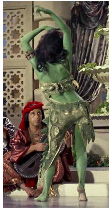
Random Green Woman

Interested parties can contact Operations with their resume.